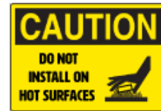
KEEP AWAY ANY HEAT SOURCE