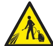
REMOVE BEFORE ENGINE WASH