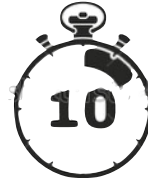
WAIT 10 MIN