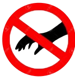
DON'T CHANGE THE SETTINGS